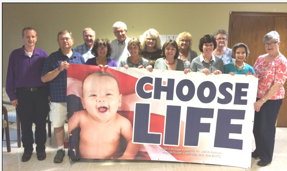
SDRTL Region 6 met July 24 at Northern State University's Newman Center to discuss goals and how best they can be achieved. Representatives from Aberdeen Area RTL, Edmunds County RTL, Leola Area RTL, and Redfield Area RTL attended.

You are taking away the power of the individual. If the federal government takes over even more of the medical care system, you will be turning over your right-to-decide to the federal government.