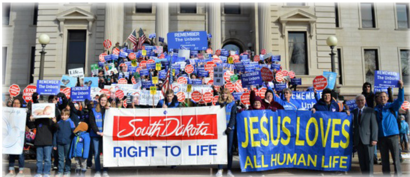
2021 SD Capitol 'Walk for Life'